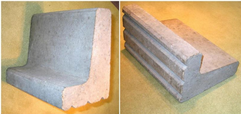
Durable yes / Concrete quality C25/30 / piece 2,5