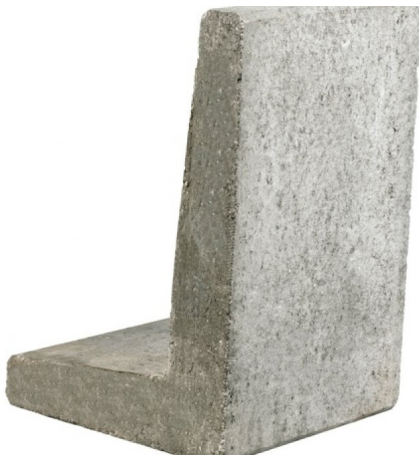
piece 2,5 / Durable yes / Concrete quality C25