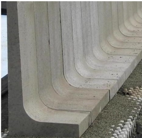
piece 2,5 / Durable yes / Concrete quality C25