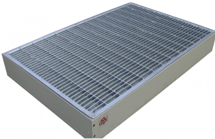
Drain hatch Basic kit / Drain openings 4 pieces., d=52 mm / Mesh width mmxmm] 40x10